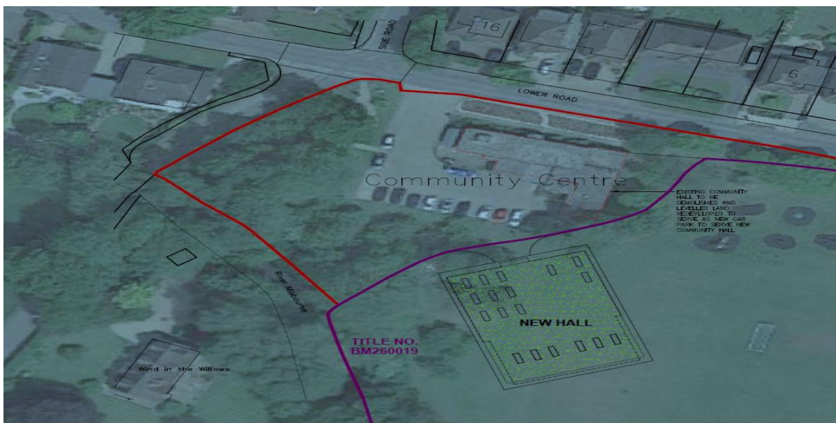
Plan of existing and proposed New Hall & Social Club location