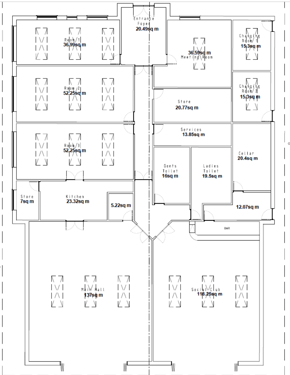
GROUND FLOOR. INTERNAL GROSS FLOOR FOOTPRINT 671.54sq m, 7228.39sq ft