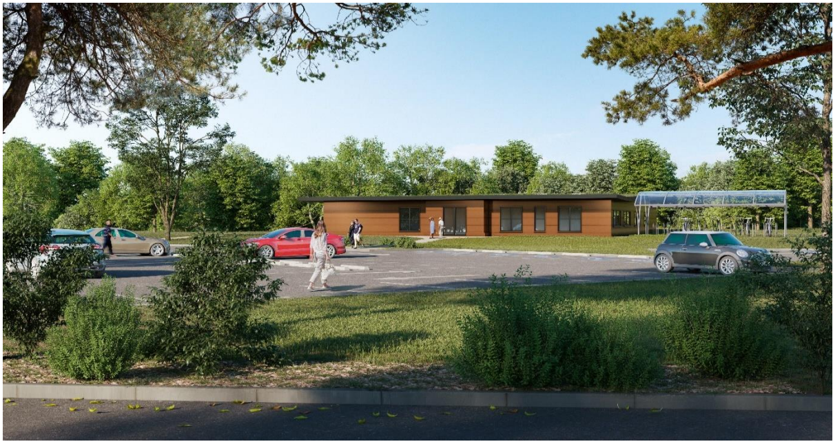
Architect drawing of the proposed New Hall & Social Club

The latest plans for the New Hall are now available and we are keen to seek the views of the community.